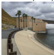
Diamond Valley Reservoir (MWD)