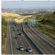
TCA Toll Roads in Orange County