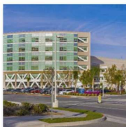
Arrowhead Regional Medical Center