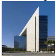
Los Angeles Police HQ Building