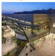
LA Community College Facilities