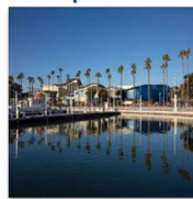
Long Beach Aquarium