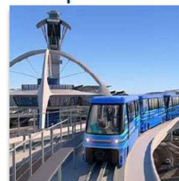
LAX Automated People Mover