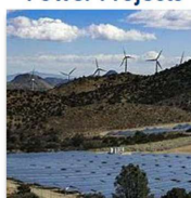
LADWP's Clean Power Projects